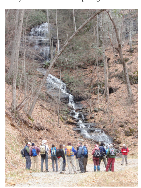
Seniard Ridge Trail.

Only Meeting Place: Back parking lot of Folk Art Center. We will hike through a range of environments and landscapes on the MST, including rocky trail sections that require good footwear